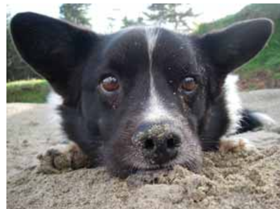
Milo rests from his hard work