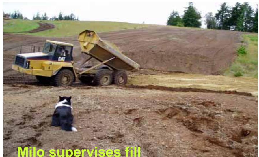
Milo supervises fill