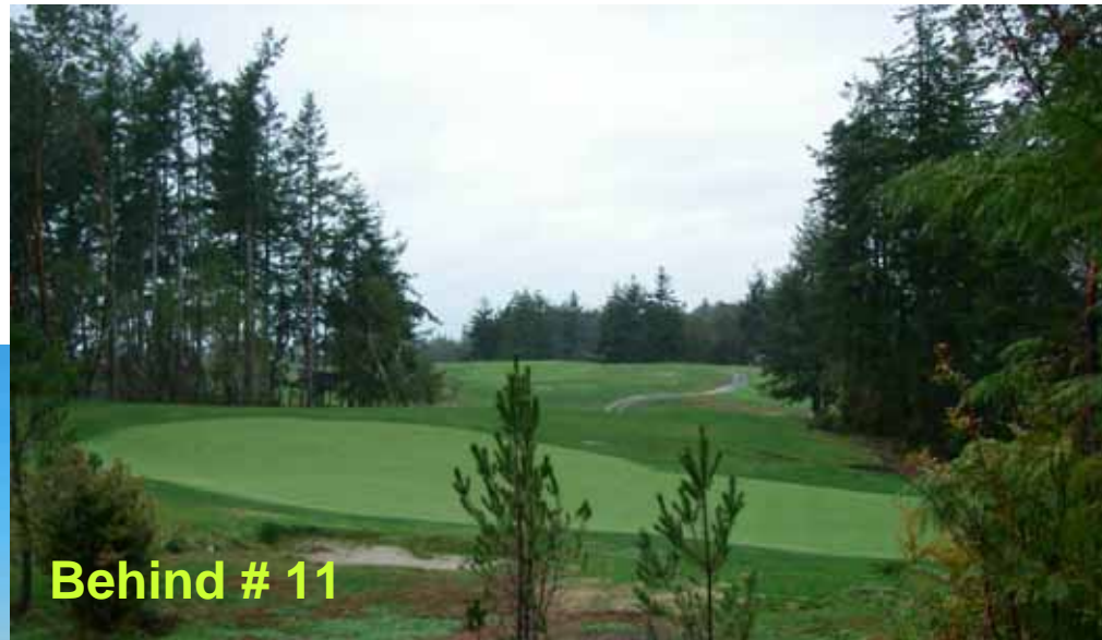
Behind # 11