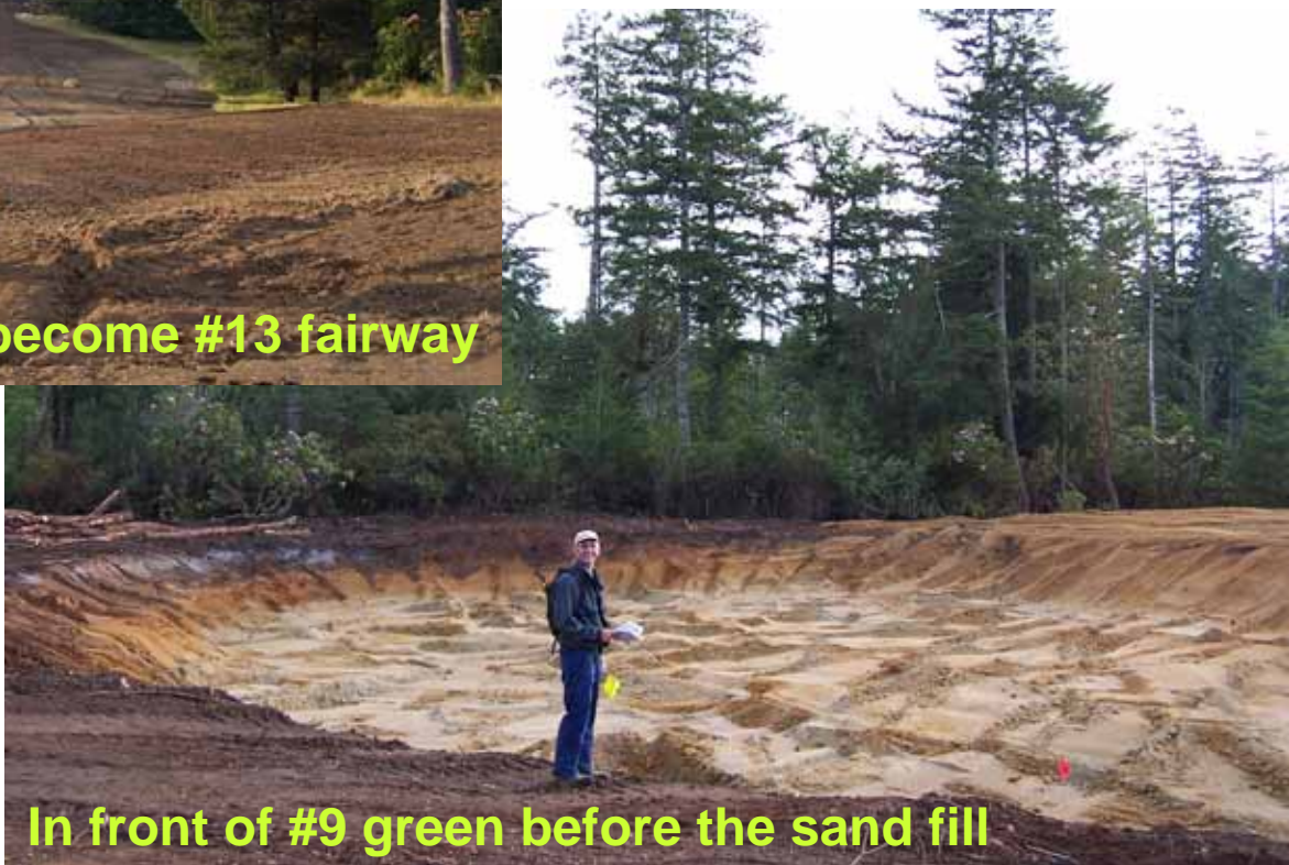
In front of #9 green before the sand fill

Oregonian Dan Hixson has created a spectacular golf design, utilizing the natural beauty of the land, creating challenge and interest in every hole