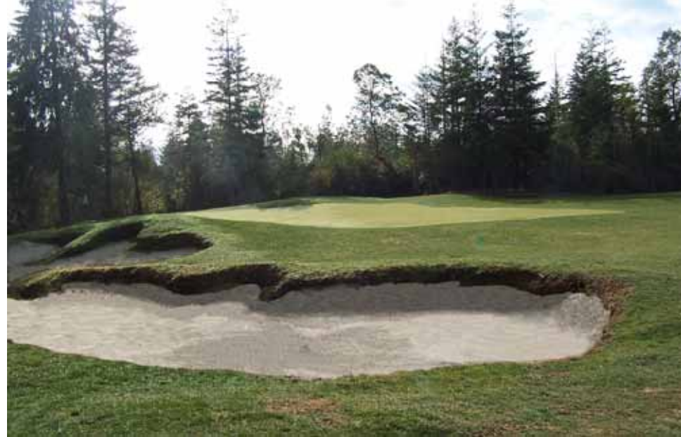
Views of #8: We were excited to see “first grass”, but grown in is even more rewarding